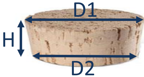
ROUGH END BUNG